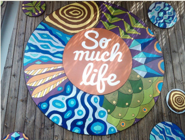
Urban Ecology Center, Milwaukee, WI