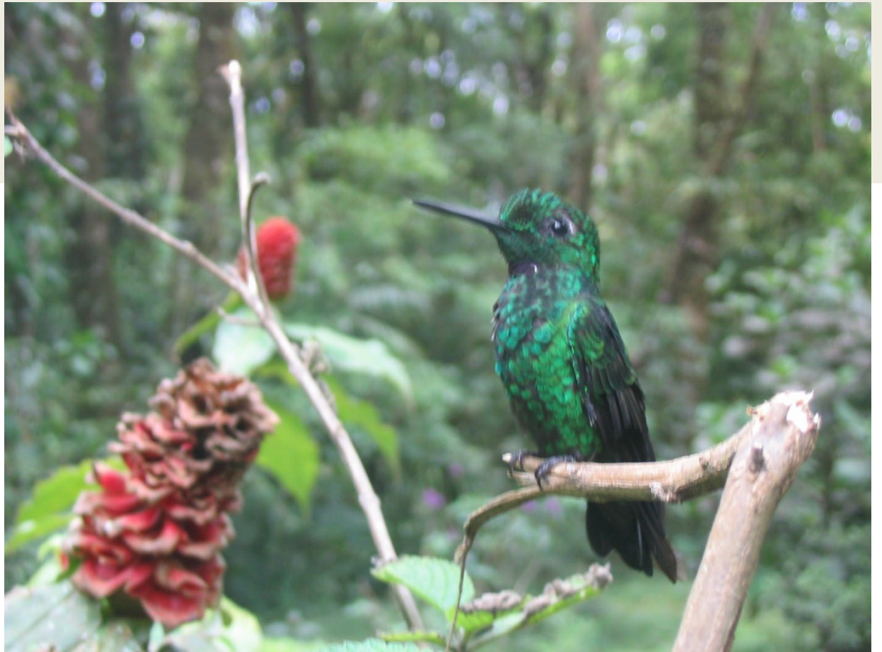
A UWSP student photo of a hummingbird during a field course to Costa Rica. Ecotourism is popular in Costa Rica.